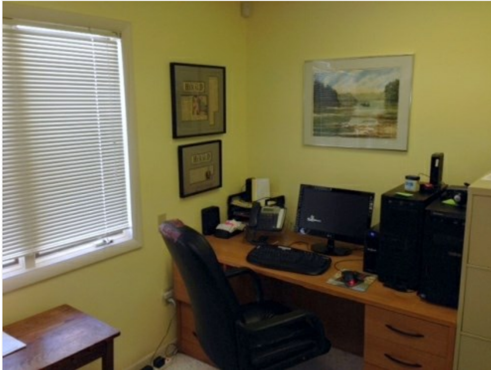
Lots of Windows!