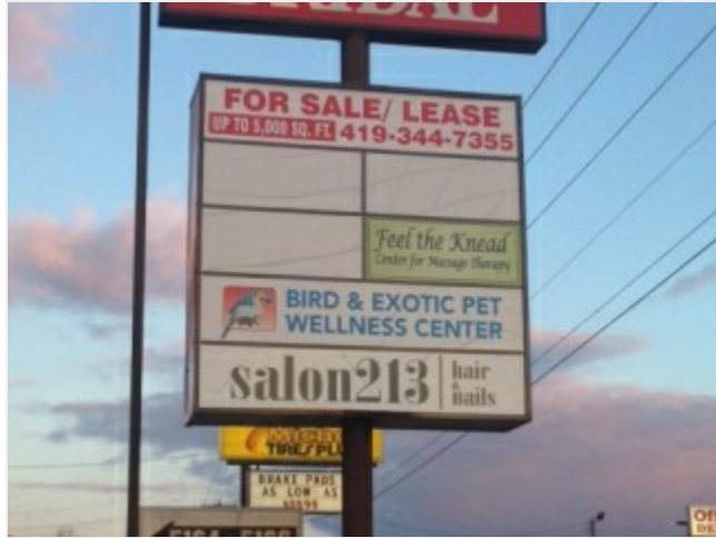
Space on pylon sign on Monroe St